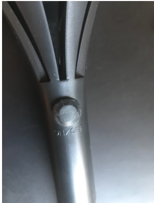
Switch at the Base of the Lamp Assembly.

Step 3: IMPORTANT! There is a switch beneath the light fixture. Turn it on before installing in a pond or prior to the first time you use Cool-Flames. To test the switch, put your hand over the solar panel at the top. If the light comes on you know the switch is in the ON position. If it doesn't turn on after cycling the switch, make sure the battery is charged by placing it in sunlight.